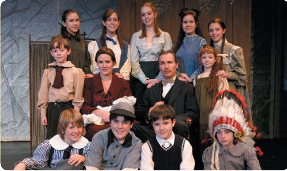
Mother and Father Gilbreth, and the 12 little Gilbreths